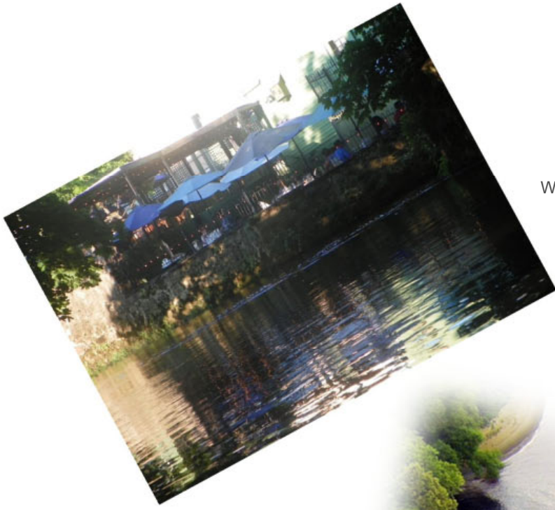
Mill Race meets the Oxbow North Branch Channel