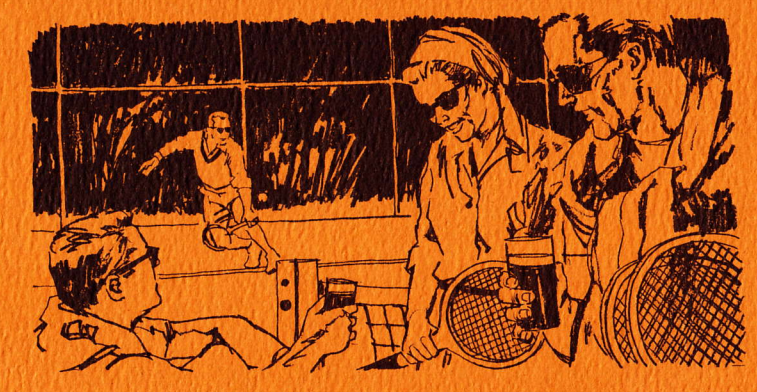
If you want to do a little more, how 'bout a few sets of tennis, or some basketball or volleyball.

If you want to do a little something, without doing too much, you can play shuffleboard.